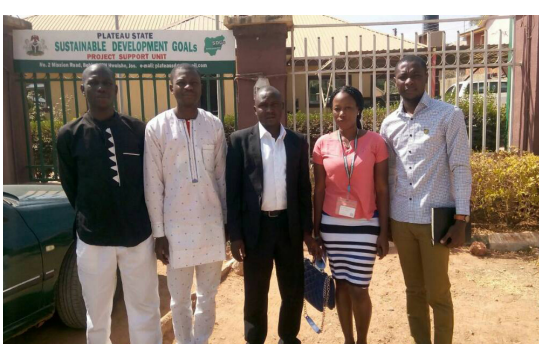
- Advocacy visit to SDG office in Plateau State by our Alliance Member

people and the implementation of SDGs in Nigeria.