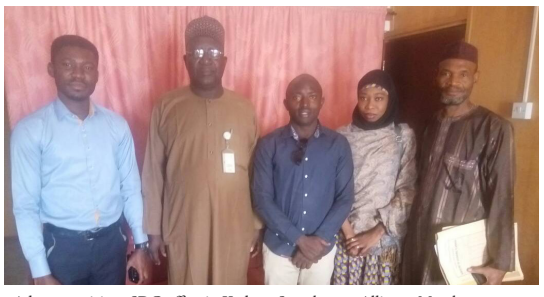
- Advocacy visit to SDG office in Kaduna State by our Alliance Members

EVA is a youth-led and youth-focused organization that works in partnership with children and young people to advance their rights to health and protection from all forms of violence. Using youth-friendly approaches, the organisation builds and strengthens the capacity of young people and helps them engage directly with policymakers and lawmakers for social change in the greas of health, child protection and education through integrated programming. As an organisation that focuses on vulnerable groups like children and young people, EVA believes that social accountability that ensures the Nigerian government effectively implement the SDGs will translate to the improvement of the lives of its target group. EVA is the Country Focal Organisation for The ACT!2030 Alliance. The Alliance is a long term youth social mobilization strategy that involves behind the scenes political lobbying and advocacy, as well as a broad systematic support to identify youth advocates at local, state and national levels. These advocates are equipped with skills and knowledge to ensure that governments are held accountable to their promises on the implementation of the SDGs. In particular, these advocates work to ensure that the universal access to young people's Sexual and Reproductive Health and Rights (SRHR) are met with the inclusion of comprehensive sexuality education and youth